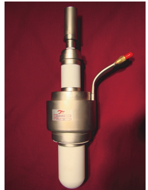
New Magnetron Tube

For More Details Call 1-800-733-9615 Or Contact Us At: sales@thermowavetech.com